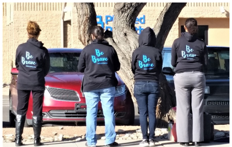
Pro-Love Tucson sidewalk advocates pray and display our * “Be Brave” hoodies

For more info go to ProLoveTucson.com or find us on social media @ ProLoveTucson . Hands of Hope can be found at GiveHopeTucson.com . Adoption info can be found at: AdoptionSolutionsofAZ .