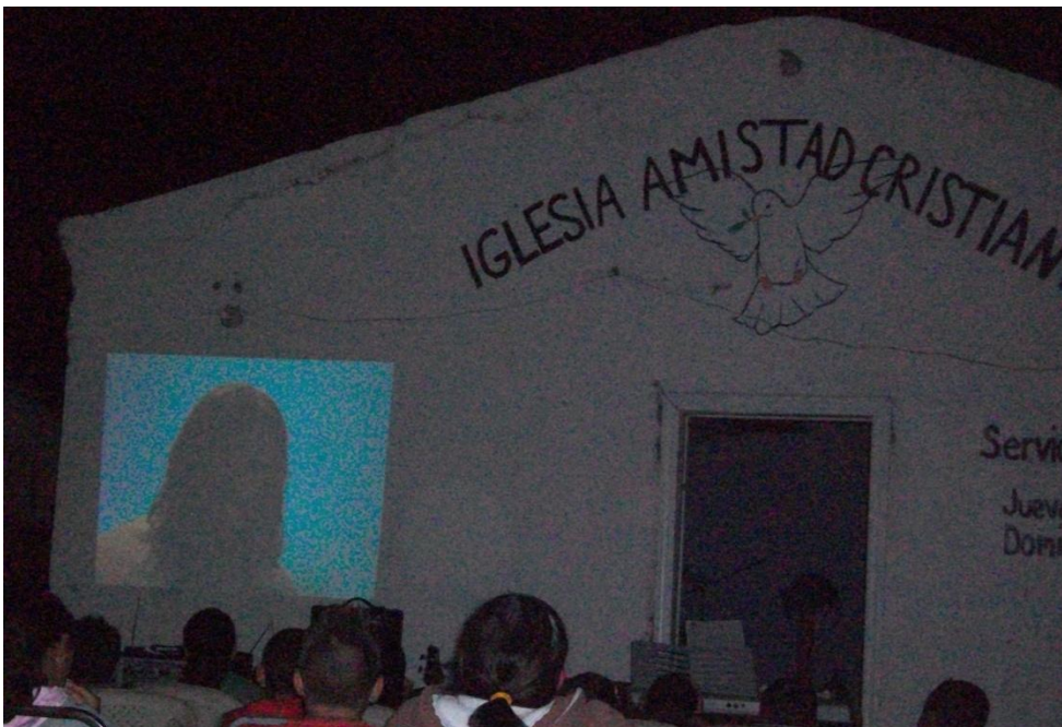
The Jesus Film being shown on the front of the church in Desemboque

"How beautiful on the mountains are the feet of those who bring good news, who proclaim peace, who bring good tidings, who proclaim salvation, who say to Zion, "Your God reigns!" Isaiah 52:7