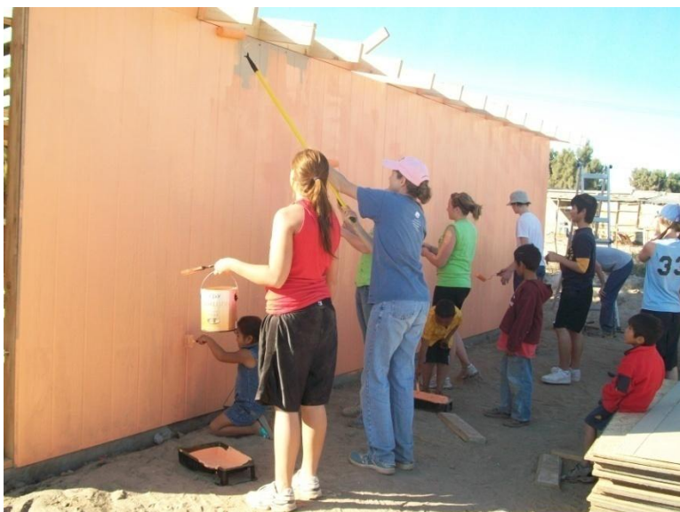
United Methodist church team paints new home