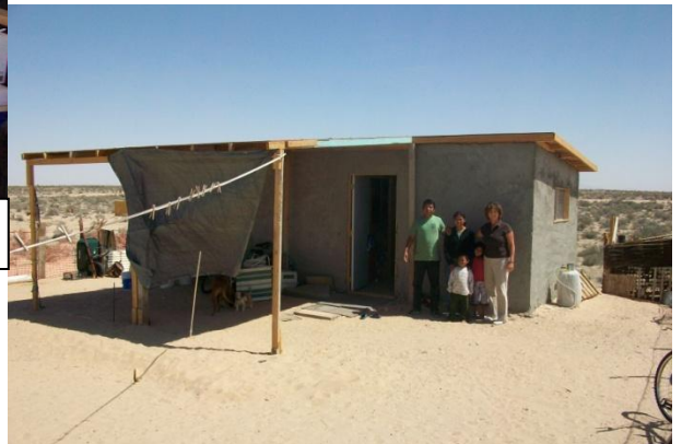
Carlos and Nadi's 'Amor' home (located in the 'invasion' area, Puerto Peñasco) built by church group from Phoenix