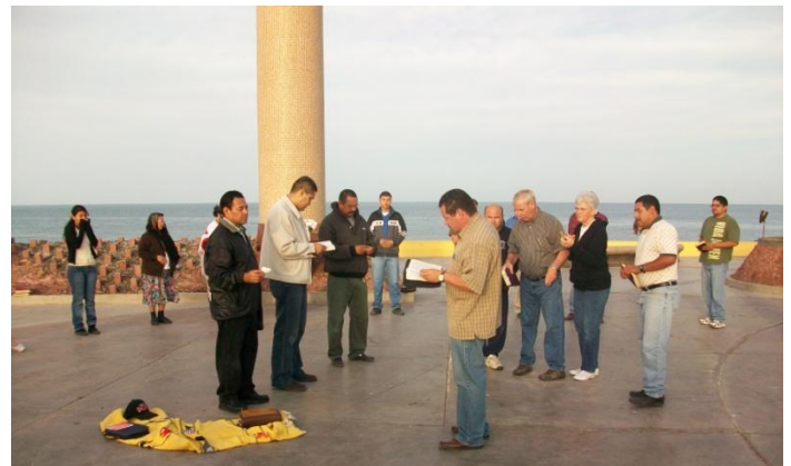
Pastors lead prayer time on Saturday morning

The evangelical churches in Puerto Peñasco come together to pray every Saturday morning at 6am. They meet at one of the churches or at the Malecón, near the port. This weekly time is open to everyone who wants to lift up prayers to Jesus. This prayer service is a corporate prayer time. Pastors and church leaders are asked to come forward and lead a prayer for specific needs. Members then pray vocally or silently as they see fit. Prayers are always lifted up for the city, state and country, for the leaders and the president, for unity of the Church, and for an end to violence and drug/alcohol addiction. Other things are prayed for as they come up. Often praise songs are incorporated into the prayer time.