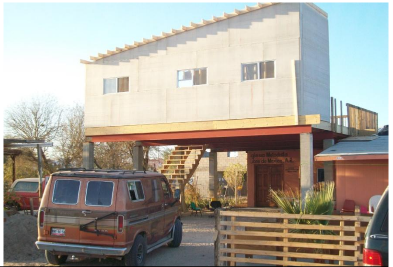
2 nd story Sunday School building added to church