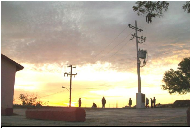
6 am prayer time on the hill above Peñasco

Praying was important to Jesus and so it is to the Mexican Christians. Praying is a common practice and it is practiced often. Peñasco Christian Fellowship Church (Compañerismo