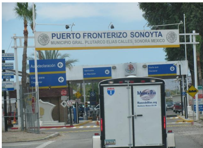
Approaching the Mexico border with our Manos de Dios utility trailer