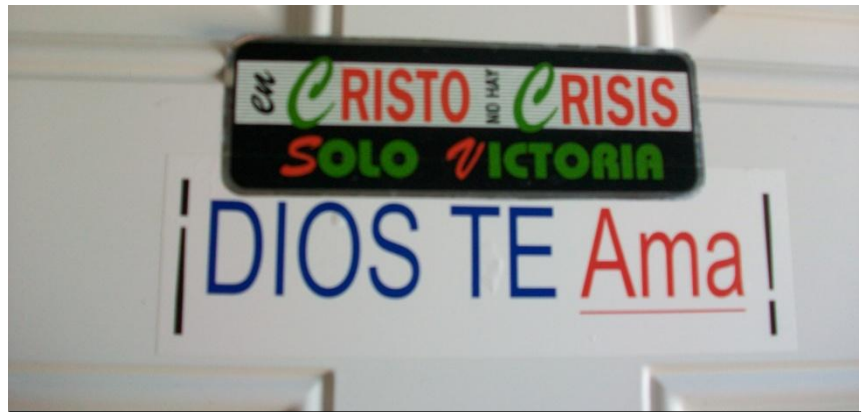
Sign on Pastor's door declaring "In Christ there is no 'economic crisis'...only Victory" and "God loves you!"

they will share their last with you when you are visiting and you will do the same when others come to visit you. In the summer, life goes on and you make the best of it because 'it could be worse' and often is for others.