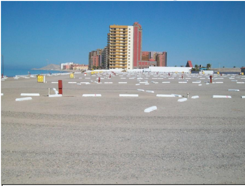
Playa Bonita campground on August 15, 2009.

August is not a time to be in Puerto Peñasco. Heat and humidity are to the extreme and so is the wind. It can be 106 degrees with the humidity at about 80 percent. Then, you hope for a breeze because you begin to sweat before you can walk ten feet. If a breeze does come up, you are blasted with sand and that sand sticks to the sweat that is covering your body. About this time you hope that the breeze will stop because it is so uncomfortable, but it is too late! The wind has glued the sand to the sweat on your body and clothes. You are starting to develop jock itch even though you are not playing sports and if you are wearing shoes your feet feel like they are in a furnace. Your hair has become wet, then covered in sand, then turned stiff and wind-blown into a hair style that cannot be duplicated. Other than that, August is not a bad month.