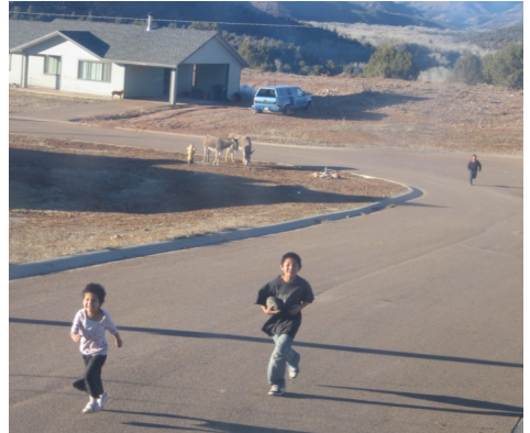
Children running to get on the Blue Bus in Carrizo. Note the donkeys in the front yard.

Once again I had the privilege of going on the Blue Bus with the AICM staff to share the love of Jesus with children on the White River Apache Reservation. On one of those trips Vicki and Suzanne joined us. When the bus enters the neighborhood that has been selected for that day's activities the bus horn is honked loudly. Immediately children begin to run out of their homes. They often are without a coat and even without wearing both shoes. They delight in jumping on the bus to receive hugs and greetings from the volunteers on board. We drive throughout the neighborhood honking the horn and picking up children ages 3 to 15. This day we picked up about 25 active children.