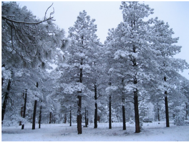
View from the back window of the Heart House

Contact us: “Heart House” phone 928-468-3171 520-404-5045 (Lucy voice or text) 520-245-2039 (Dennis voice ) GetInvolved@ManosdeDios.org