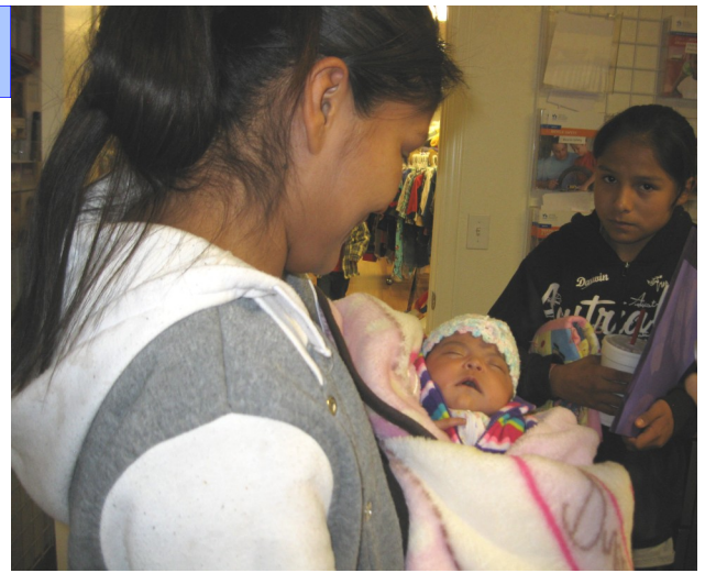
A mother brings her new baby to the center to 'purchase' diapers and baby supplies. Big sister looks on.