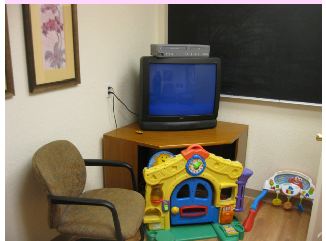
One of the LHWC classrooms in Whiteriver where parenting, prenatal, budgeting, and Bible classes are viewed on DVD. Clients then meet with a staff member to review the class material and pray.