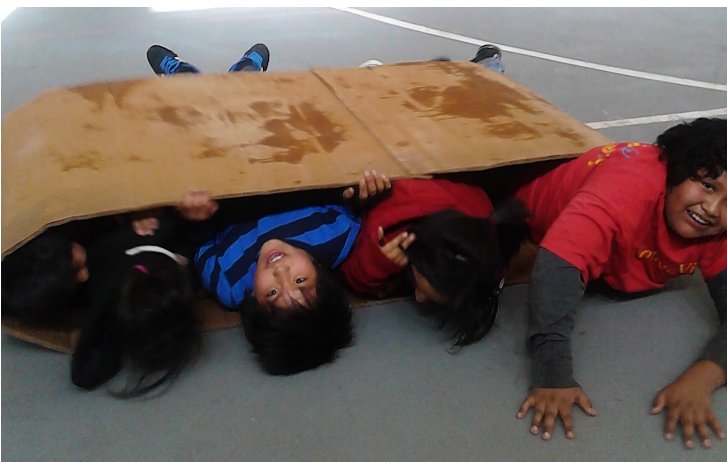
AICM students playing in gym... simply give them a cardboard box! Future student council representatives??