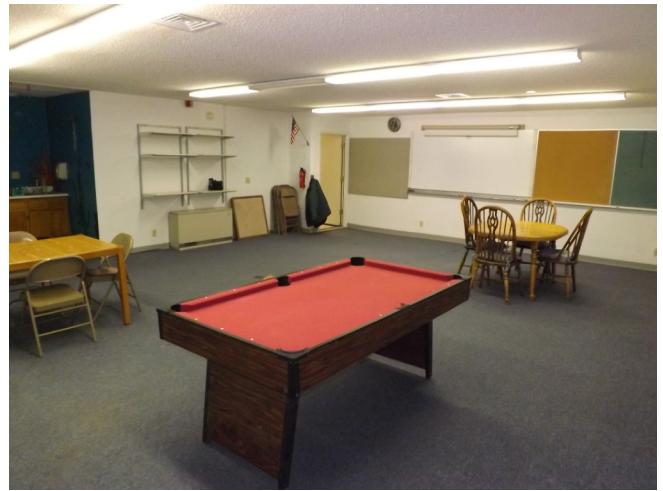
New AICM Rec Room. New game tables to be added shortly, thanks to generous donors!

We have also received a donation of a laptop to be used to play games and for after school tutoring. We will keep you posted on our progress!