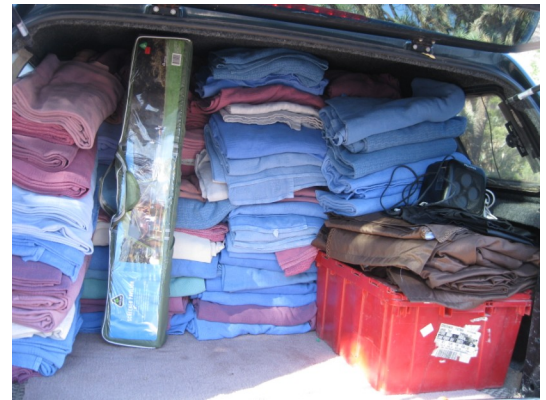
Blankets going to Mexico