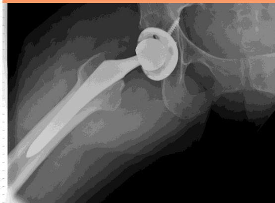
X-ray of Lucy's new 'bionic' hip