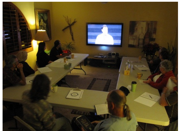
Love & Respect DVD Conference being shown in a home

The message of this conference was well received by the twenty-seven attendees in January. We enjoyed wonderful fellowship and heard powerful testimonies of marriages being encouraged.