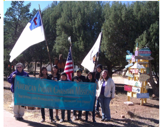
AICM middle school students participate in a ‘march against domestic violence’