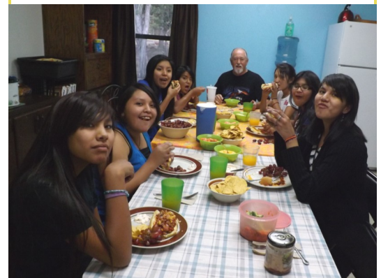
Once a week we have ‘family style’ dinner in our dorm. Our girls love to eat!