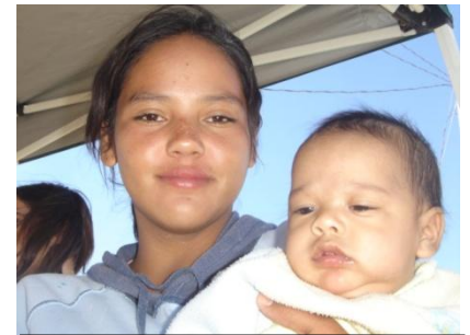
Fifteen year old mom and her baby in barrio

I am enjoying focusing on the Reason for the Season . I love Christmas music and cherish the words of the well-known carols including, "O come, let us adore Him, Christ the Lord". We are simplifying our lifestyle and spending much time with friends and family here and in Mexico. Listening to: Jaci Velasquez' CD "Navidad" and Casting Crowns' new album "Peace on Earth" (especially love the song 'While you were Sleeping'). Meditating on the book of Joel. Singing scripture...especially Psalm 145.