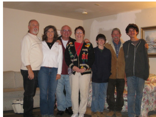
Our volunteer team from November work trip