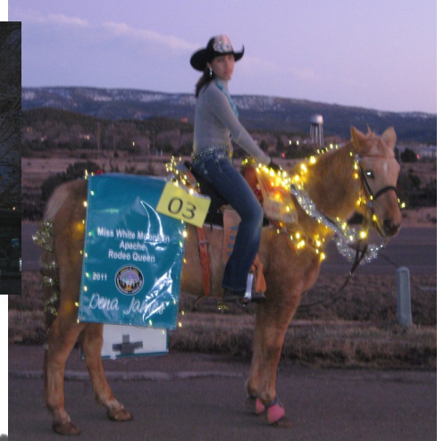
Above: Rodeo Queen and horse lit up for the Light Parade.

To left and above: Floats declare this year's parade theme: "The Reason for the Season"! Yeah!