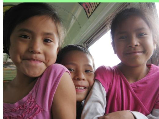
Learning about Jesus on the bus!