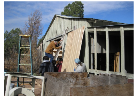
Constructing barn doors at AICM

Lucy and I settled in on the first day and met more of the AICM staff, students and house parents. We also delivered 150 blankets that were to be distributed on the Apache Reservation in early December, donations to the school consisting of: food, kitchen items, medical supplies for the school nurse, games for the children's homes and an assortment of much needed supplies.