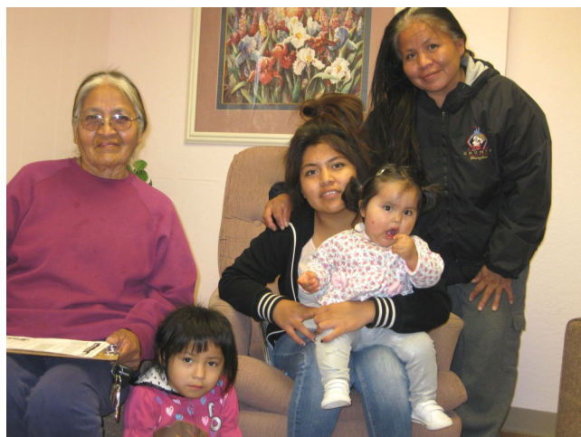
A four-generation family come to the LHWC for parenting classes!