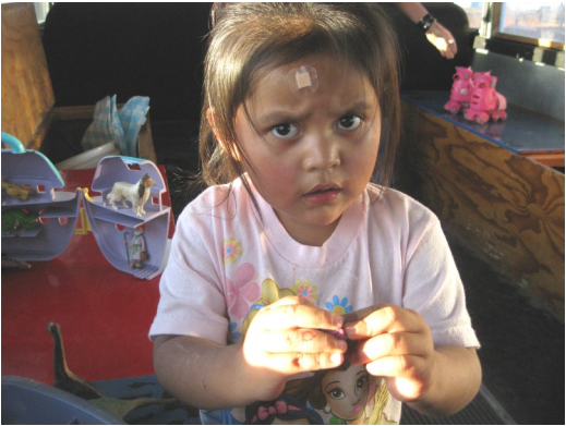
Apache girl participates in “Jesus” bus ministry

While serving in Mexico we saw poverty, how the corrupt government held back and abused their people, and the great need for housing for many people. There was also some drug, alcohol and physical abuse going on that needed to be addressed. But, for the most part families were functional and the children were relatively safe and somewhat secure.