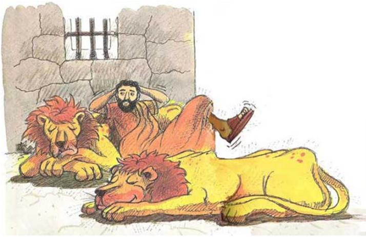
Daniel in the Lion's Den

"...These bad men talked the king into making a law that said you must only pray to the king and if you did not, you would be thrown into the lions' cage.