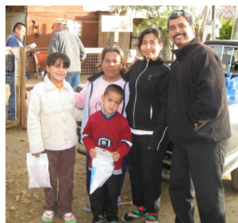
Friends on Apache Reservation and in Mexico!