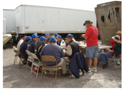
Border Guard luncheon