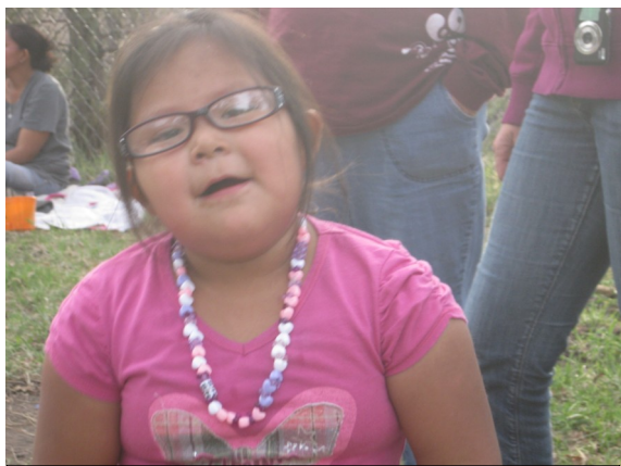
Kids enjoy egg hunt & prizes (note necklace!)