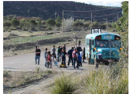
“Jesus” bus children’s ministry in Cibique