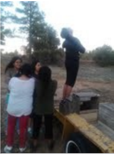
Girls do 'faith falls' and climb wall on obstacle course on campus