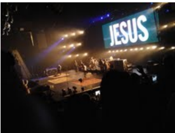
Chris Tomlin and Kari Jobe in concert at Grand Canyon University