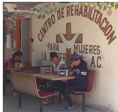
Women's Rehab center where additional rooms are needed.

During our recent visit to Peñasco, I discovered that the Woman's Center is in need of three small rooms to be built on to their existing building. After prayer and asking God how we can help, it was put on our hearts to assist them by helping to provide the counseling room they need. The building will be made of block (their preference) and some of the men from the Men's Center will help provide the labor. In the near future I will be