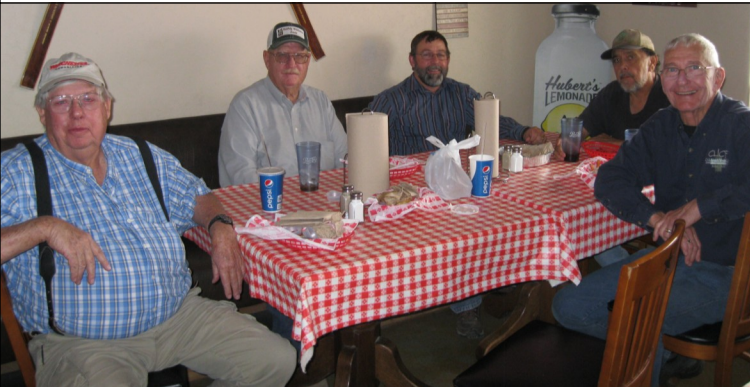
Men's work team from Calvary Chapel Round Valley enjoy lunch after work project at Living Hope Center in Springerville.

After the project was completed, we had a time of fellowship and a delicious meal at Avery's BBQ Restaurant. If you are ever in Springerville, AZ you must eat there. It is a Christian-owned family restaurant on the west side of town on Hwy 60. Delicious and so worth the trip!