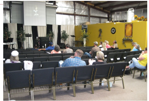
Participants view DVD conference at Calvary Hills church

Another participant said, "The weekend was summed up in our closing prayer of commitment. 'Now is a time to put a stake in the ground; to love and respect as unto the Lord ; to look through my spouse to the Lord Jesus; marriage is a tool and a test to help me mature to become a woman of God.' (How am I going to become a godly old lady without being refined as a young one?)" Another commented "My husband didn't come, but he can already see the difference in my behavior!"