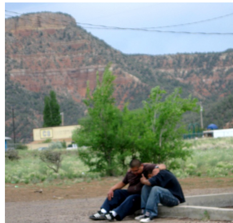
Bible Study member prays with intoxicated man outside of WMAC Church