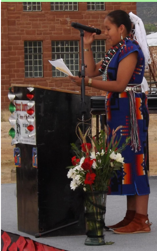
The Salutatorian, dressed in traditional garb, delivers her speech in both the Apache Language and English.