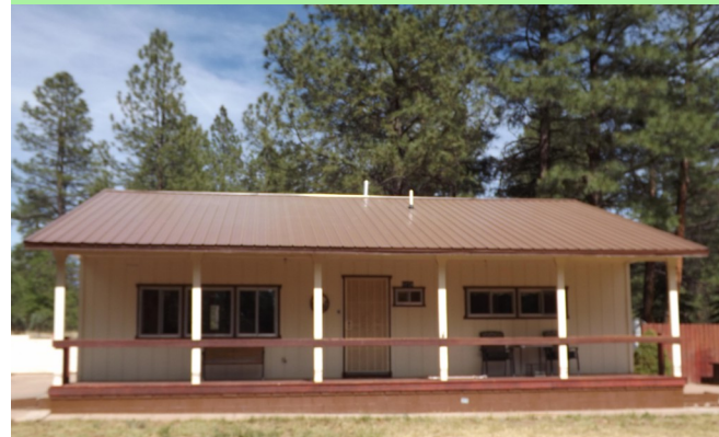
Heart House with beautiful new brown metal roof