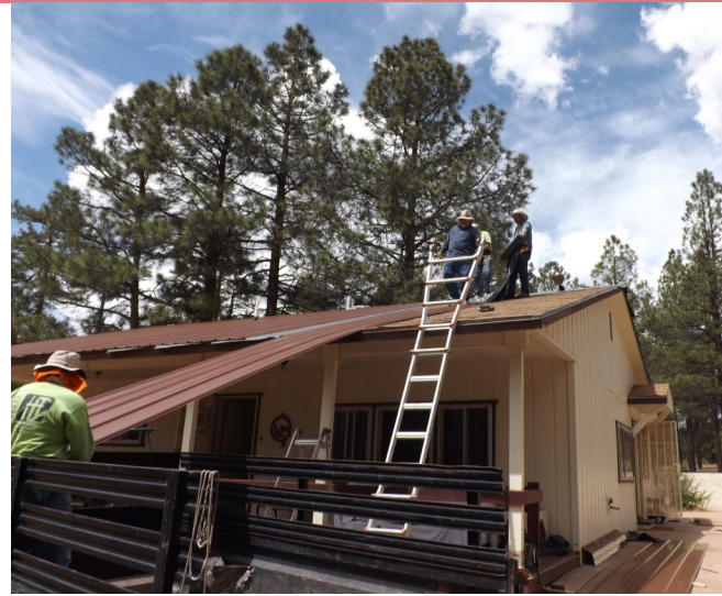
Volunteers put new metal roof on Heart House

We can't thank these men and women enough for the hard work they have done to make the house a beautiful place! It is truly a house put together with love and for the sake of love.