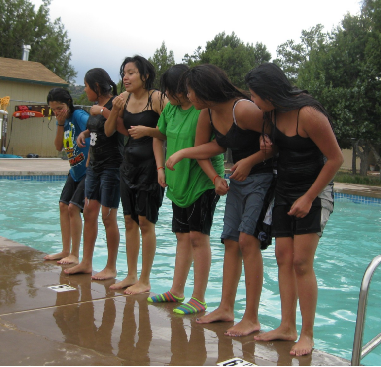
Our six girls take one last swim together at AICM pool

Monday May 20 th began the last week of school at AICM. With the kids getting out of school in just a few days they were not very excited. They were still excited about playing in the gym, but the usual spark and chaos seemed to have diminished. Some were making comments such as, “I don’t want to go home,” “I wish school was not over,” “I don’t want tomorrow to come,” and “I want to stay here.”