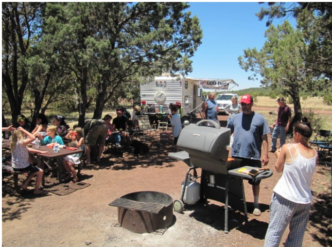
Cooking and serving lunch for evacuees in campground, Lakeside, AZ