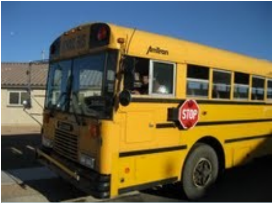
Dennis takes a turn driving the donated bus

As we took off from the bus yard we discovered a flat nose bus was not designed for high speed driving on the highway. And, although we would not need it until later, the bus did not have air conditioning! All in all, Friday was a good day. We drove almost 700 miles (thanks to Brian), kept cool (thanks to a little rain and cooler temperatures) and the bus rolled along at a brisk 65 mph. We stayed the night in the Kansas City, Missouri area.