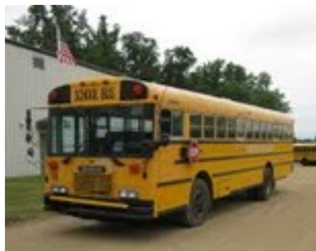
71 passenger bus donated to Manos de Dios by bus company in Wisconsin!