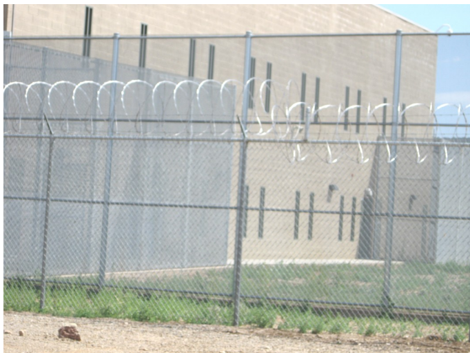
Jail facility in Whiteriver, AZ on the White Mountain Apache Reservation. This facility is only about 2 years old.