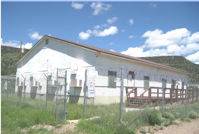
Living Hope Women's Center in Whiteriver.

Mission Statement: To assist men and women in making choices that remove obstacles, build strong families and honor life.