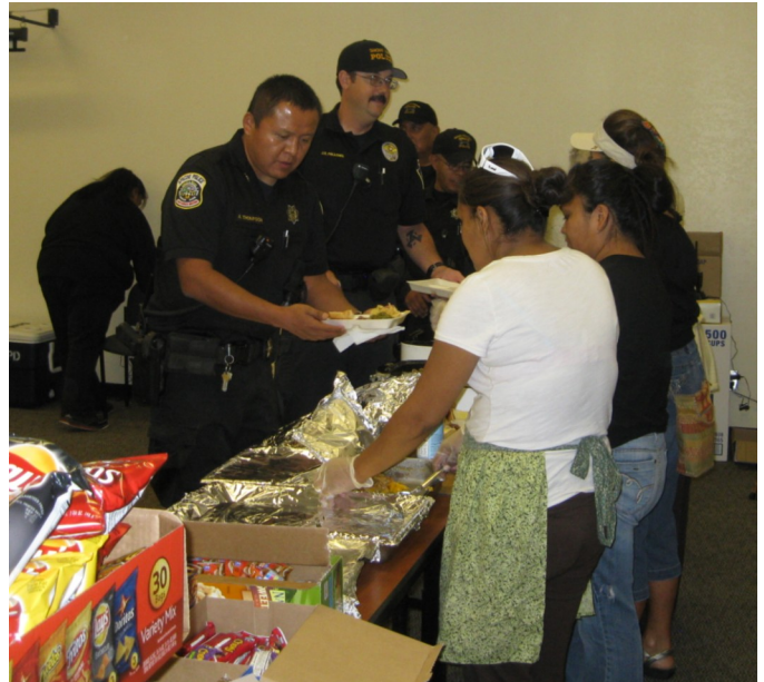
Serving a home-cooked meal to many police in Whiteriver during the busy Indian fair week.

The biggest event of the year on the White Mountain Apache Reservation is the week long fair and rodeo which includes a big parade on Saturday. Many different tribes attend the fair, participate in the rodeo and set up vendor booths with everything from Indian fry bread to traditional jewelry and clothing. Many police agencies from all over central Arizona and northwest New Mexico come to assist the White Mountain Apache Police Department in handling the approximately 20,000 to 30,000 people who attend the festivities.