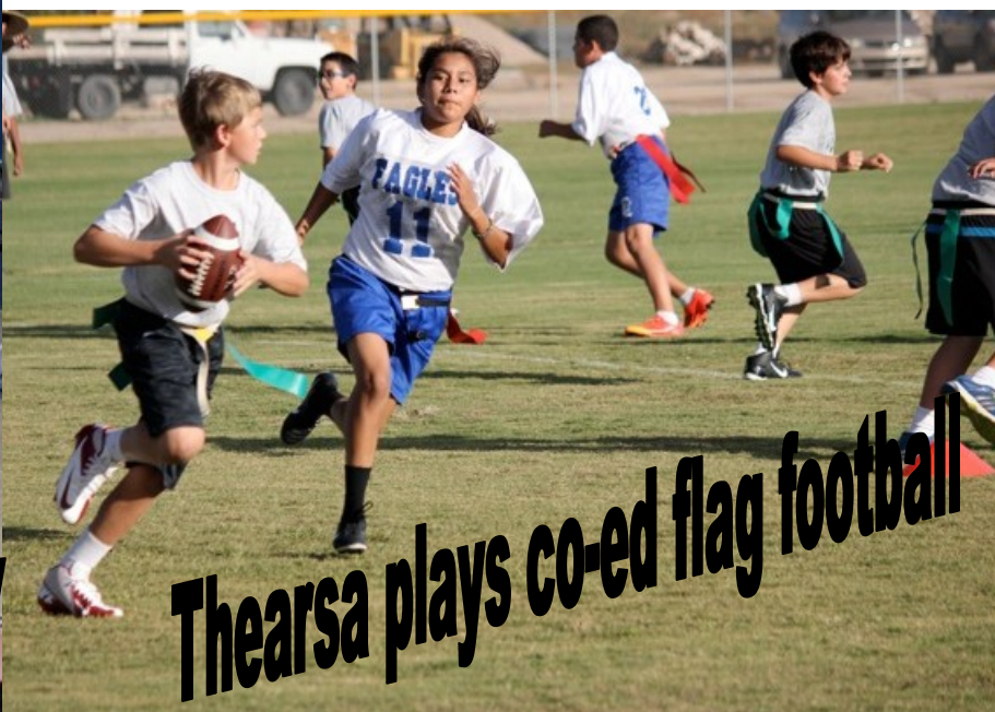
Thearsa plays co-ed flag football